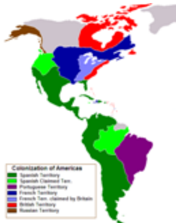
Colonization of the Americas (click for larger).