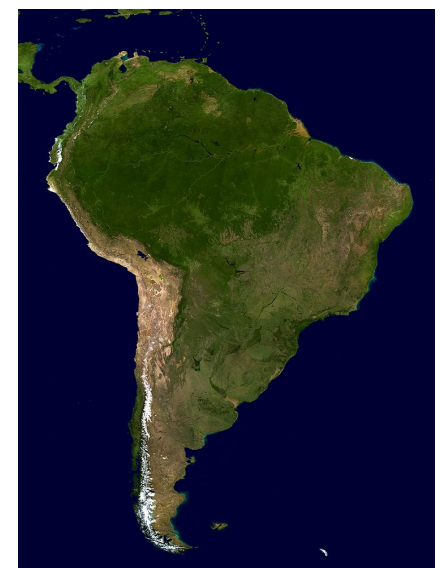
Satellite Map (click for larger).